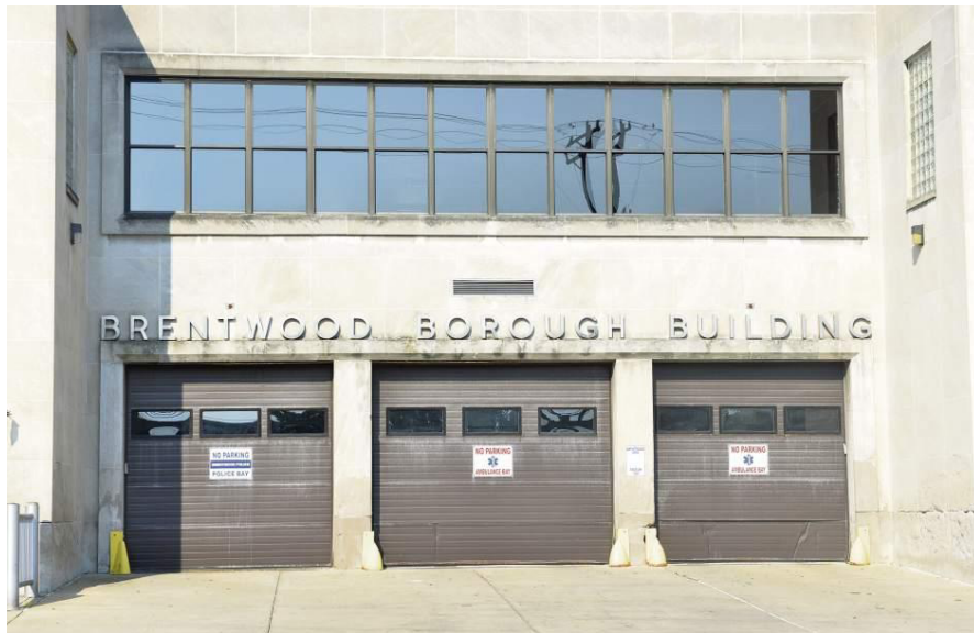
Brentwood Borough municipal building photographed Wednesday, July 19, 2017.

SUZANNE ELLIOTT ( MAILTO:TRIBCITY@TRIBWEB.COM?SUBJECT=RE: BRENTWOOD HIRES FIRM FOR NEW BOROUGH BUILDING DESIGN STORY ON TRIBLIVE.COM ) | Tuesday, Sept. 26, 2017, 12:15 p.m.